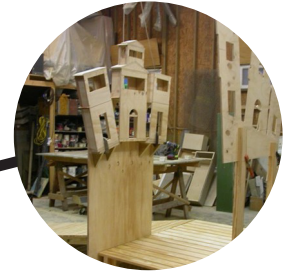
TOUGALOO COLLEGE / CIVIL RIGHTS