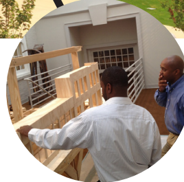
FARISH STREET / THE ARTS

All the pieces will be gathered in The Art Garden at the Mississippi Museum of Art for the first three weeks of March 2013.