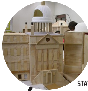
STATE CAPITOL / CIVIC ENGAGEMENT

C3: Creativity. Conversation. Community.