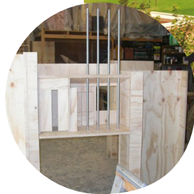
OPERATION SHOESTRING / ART EDUCATION